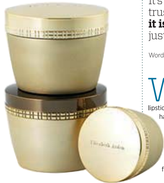
92 SAGAMAGAZINE February

This is not about looking fashionable but is about looking the best we can – when we feel we look good it boosts our self-esteem too. From trying a new skincare range and booking a makeover to trying a different hair style or the latest nail art, we have lots of ways to help you refresh your beauty routine.