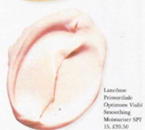
Lancôme Primordiale Optimum Visibly Smoothing Moisturiser SPF 15, £39.50