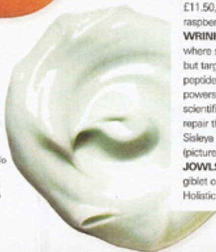
Givenchy No Surgetics Plastisculpt Cream, £45