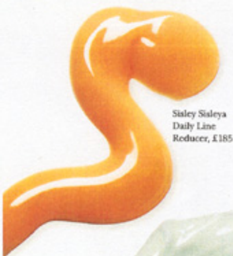
Sisley Sisleya Daily Line Reducer, £185